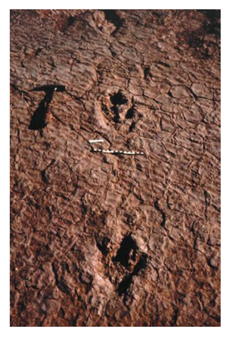
Fig. 5 - Ichnosite of Matadouro (SOMA), municipality of Sousa, Sousa Formation, in the bed of the Peixe River. A fine theropod trackway (SOMA 1). Graphic scale in centimeters.

These tracksites and the correspondent ichnofossiliferous levels contain the following numbers of trackways or isolated footprints assigned to different categories of dinosaurs: 329 large theropods (figures 1 and 5); 31 smaller theropods having a third toe substantially longer than the other two toes; five additional, different kinds of small theropods; 16 medium-size theropods from