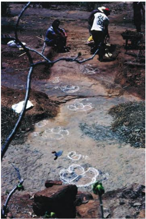
Fig. 9 - Serrote do Pimenta ichnosite, Estreito Farm, Antenor Navarro Formation, Sousa county. Holotype of Caririchnium magnificum Leonardi, 1984b during the second phase of excavations in 1988. It is a long trackway (25 excavated meters) of a quadruped iguanodontid, with 7 manus-pes sets and, after a long gap, several additional sets of poor quality. The clipboard, length 32 cm, as a scale.

from Rio do Peixe Basins is the sauropod Triunfosaurus leonardii Carvalho, Salgado, Lindoso, Araújo Jr., Nogueira & Agnelo, 2017; but, because of the tracks discovered, it is known that there were also theropods. Both of these bone specimens of titanosaurid sauropods come from the sandstones of the Rio Piranhas Formation,