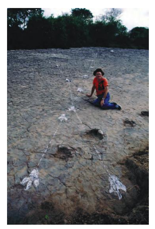
Fig. 11 - Passagem das Pedras (SOPP), Sousa county, Sousa Formation. The author is observing the intersection of two trackways imprinted by running predatory dinosaurs of the same kind, paratypes of Moraesichnium barberenae (SOPP 3 and 4; respectively running or trotting at about 20,7 and 12,8 km/h), with the trackway of a quietly walking ornithopod, the holotype of Sousaichnium pricei (here footprints 20 to 23 of the trackway. The iguanodontid was pacing at about 4.2 km/h).

between 12.8 and 23 km/h. These last four trackways, all belonging to medium to large theropods (fig. 11), correspond to the fastest runners of the Rio do Peixe ichnofauna (Leonardi et al., 1987a, b, c).