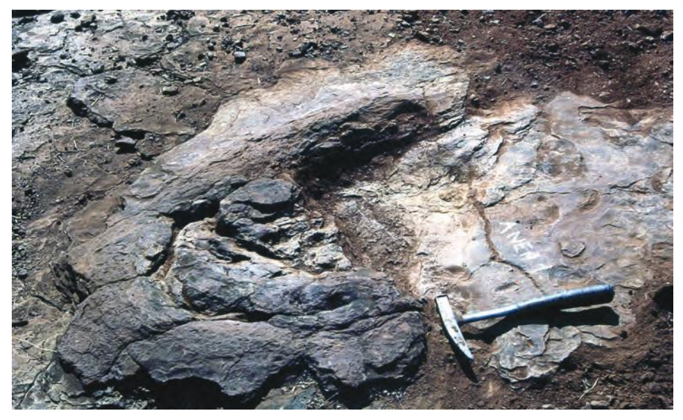
Fig. 6 - Ichnosite Engenho Novo (ANEN), county of São João do Rio do Peixe, Sousa Formation. An important and rare (in the whole Sousa basin ichnofaunas) and unfortunately incomplete hand-foot set of a large sauropod (ANEN 10). Note the wide and thick displacement rims of the prints. The horse-shoe-shaped forefoot prints are almost obliterated by the high anterior displacement rim of the hind-foot print. The hammer as a scale (32 cm).

The first tracksite, on the Serrote do Mocó (ANSM; S 06 42.752, W 38 24.752), is rather close to the Engenho Novo tracksite (ANEN) near a bridge over the Rancho creek; the new locality presents a series of interdigitations between the Sousa Formation and the Antenor Navarro Formation. The first formation shows, on this site, beautiful theropod footprints, probably attributable to abelisaurids, imprinted in fine ripple marked surfaces (fig. 7); the second formation shows deep footprints of medium-sized sauropods.