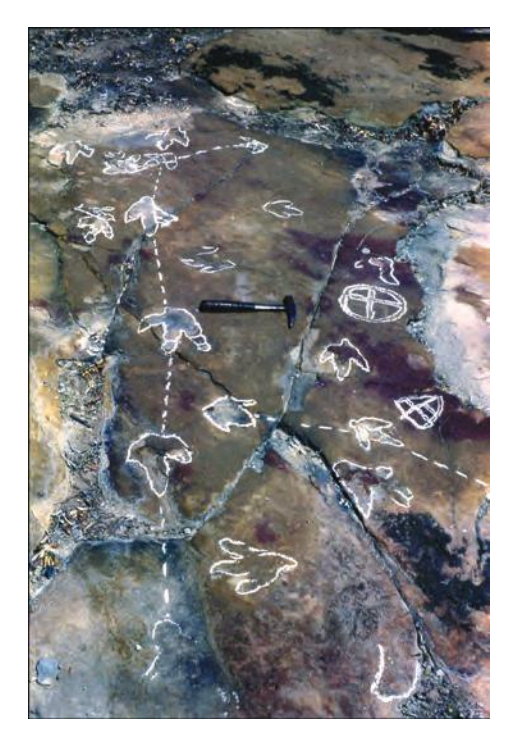
Fig. 8 - Serrote do Letreiro (SOSL) tracksite, Antenor Navarro Formation, Sousa county. This coarse-grained rocky surface shows, along with Indian petroglyphs, 34 theropod tracks, often filled in by coarser sand and so in apparent reverse relief. The hammer as a scale (32 cm).