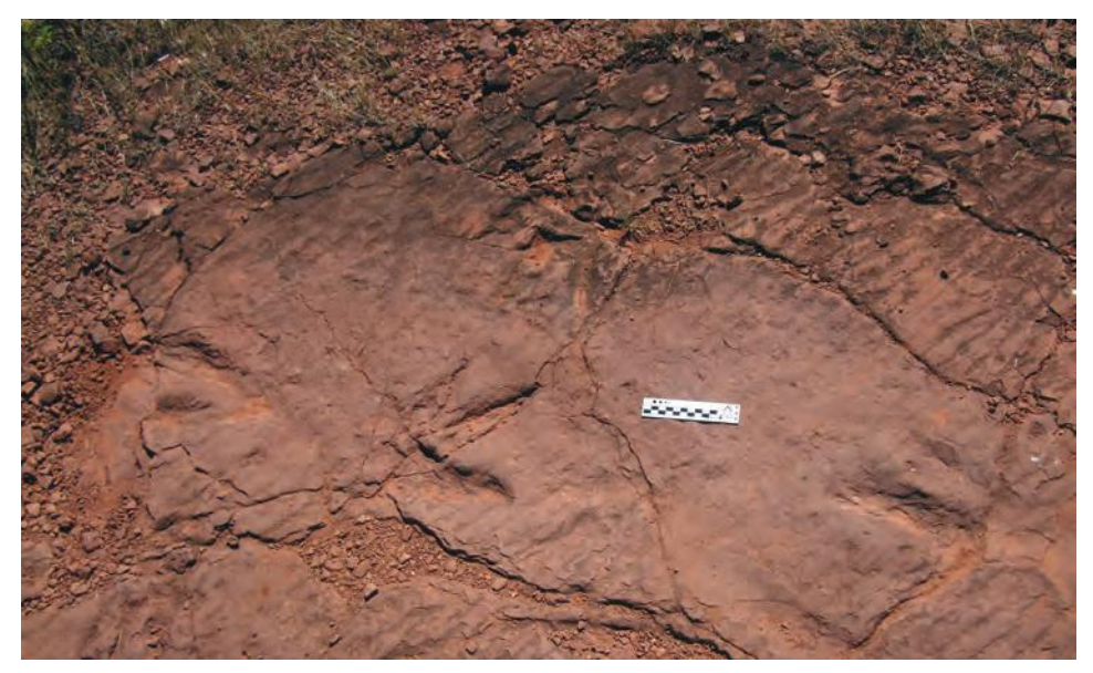
Fig. 7 - The new ichnosite Serrote do Mocó (ANSM) near a bridge over the Rancho creek, county of São João do Rio do Peixe. The site is located near the limit between the Sousa Formation and the Antenor Navarro Formation. It shows beautiful theropod footprints, probably attributable to abelisaurids, imprinted in fine ripple marked surfaces. Graphic scale in centimeters.

compass, metric tape, and strings stretched taut in the main directions, above all along the midlines of the trackways, and then with the gridded quadrant system (Leonardi, 1977) using a rectangular wooden frame with nylon threads stretched at right angles forming squares with sides 5 cm long. The drawing of each 5 \times 5 -cm square was then reproduced on a convenient smaller scale on graph paper. The angles among the strings were measured directly with a contact goniometer (Leonardi, 1977). It would have been easier to employ a drone to get a bird's-eye view (and to take photos) of our trackways, but there were no drones when we developed this field research.