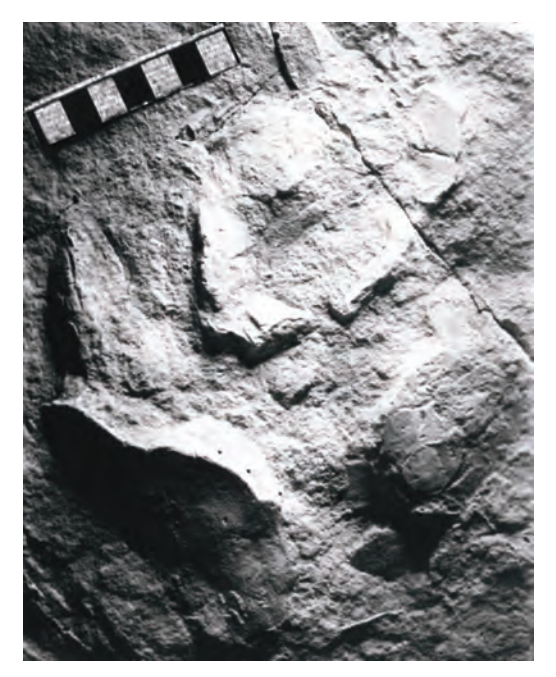
Fig. 10 - A cast of an ankylosaur, probably nodosaurid, rare hand-foot set from Serrote do Pimenta (SOES), kept in the collections of the Câmara Cascudo Museum of Natal. Graphic scale in cm.

The sauropods are less frequent in these formations. Their fossil footprints indicate in the basin of Sousa 59 individuals divided into three great groups that marched in herds, with evident gregariousness; and some isolated individual tracks. Sauropod tracks are often of poor quality, and typically very large (fig. 6). We can speak of at least three different kinds. The ornithopods were rarer, and their trackways are partially bipedal, partly quadruped (fig. 9) and partly semi-quadruped (cf. fig. 2). Most are isolated and therefore not gregarious individuals, usually of large dimensions (38 individuals). The main ones have been assigned locally by this author to three ichnogenera (Leonardi, 1979a, 1984b), attributed to iguanodontids, without excluding other forms. There are also some specimens of small ornithopod tracks, possibly dryosaurids.