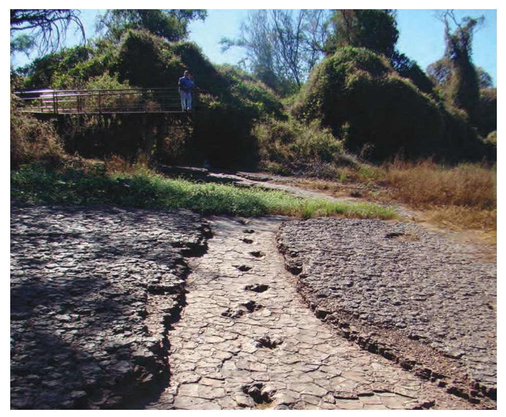
Fig. 1 - The classic locality of the Passagem das Pedras, discovered by Luciano J. De Moraes, in the 1920s, in the Sousa county and in the Sousa Basin, with two tracks in the siltstones and shales of the Sousa Formation. Here, the trench dug in 1977 to uncover the trackway SOPP 5, paratype of Moraesichnium barberenae Leonardi, 1979. Note the primary and secondary mud-cracks in both main layers. In the background you can see one of the walkways and observation pitches that allow visitors to the natural park "Valley of the Dinosaurs" to see the trackways of the dinosaurs without trampling them.

success by Carvalho and others (Carvalho, 1989; Carvalho & Fernandes, 1992; Carvalho et al., 1993a, 1993b, 1994; Viana et al., 1993).