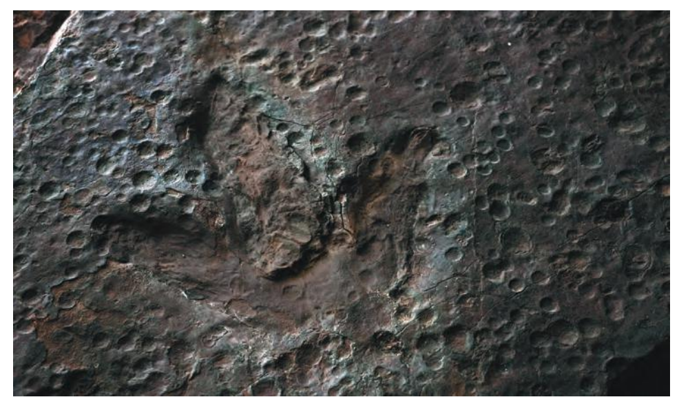
Fig. 4 - Medium-size theropod footprint at the level 13, subsite 2, of the Piau-Caiçara farm (SOCA 13217). This is a rocky pavement covered by the impressions of raindrops fallen (from north- and southward) after the crossing of 34 theropods.

identified through palynological analysis from boreholes drilled by Petrobras (Roesner et al., 2011).