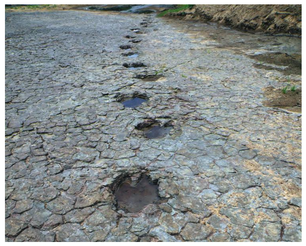
Fig. 2 - The holotype trackway Sousaichnium pricei Leonardi, 1979, at Passagem das Pedras (SOPP), Sousa county, Sousa Formation. It is famous, as its image, after its excavation in 1977 and published in 1979, has been reproduced in countless scientific publications. Some 52 hind-foot prints were excavated, along with about 25 forefoot prints, but only of the right manus. The trackway is attributed to a Gondwanan semib-ipedal ornithopod. The average width of the footprints is 35.7 cm.

the Sousa basin – a bountiful tetrapod ichnofauna have been found, consisting of tracks, mainly of large theropods, sauropods, and ornithopods. Fish trails have been also discovered and classified Cochlichnus sousensis Muniz, 1985 (Also see Leonardi & Muniz, 1985). Invertebrate ichnites, such as trails and burrows produced by arthropods and annelids, are also common (Fernandes & Carvalho, 2001). Along with the strong reddish color, typical of subaerial environments, there are some units of greenish shales, mudstones, siltstones and sandstones, where rare body fossils are present. These include ostracods, conchostracans, plant fragments, palynomorphs, fish scales, and bone fragments of crocodylomorphs, along with rare dinosaur bones.